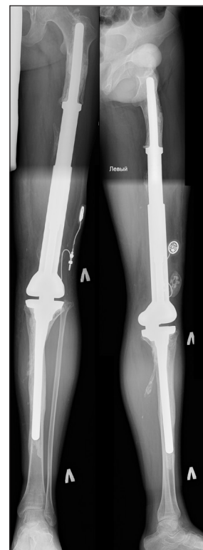
Fig. 4. MUTARS growing prosthesis in distal femur replacement. Note the small implant connected to an internal motor that is implanted subcutaneously and can be controlled by an external device

can preserve the growth plate in the uninvolved side of the joint. The new MUTARS Expand uses a similar approach. A motor housed in the prosthesis is connected to a subcutaneous receiver and can be activated and controlled by an external device, allowing exact length adjustment (up to 10 cm) without any surgery (fig. 4). Both systems can be controlled in the outpatient clinic without hospitalization. All these prostheses are designed to bear the corresponding loads over several years but they are only adjustable in length and do not grow concomitantly in strength and breadth. The devices might be at greater risk of breaking under the adult weight and finally would have to be replaced by a permanent implant. After unsatisfying results at the beginning of the era of growing prostheses, the first experiences with the new systems are promising. But whether they will prove of value in practice can only be answered over time.