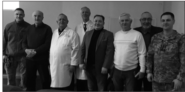
Fig. 4. Participants of the scientific and practical conference “Combat trauma” 16 February 2023, Kharkiv

implementation of new technologies for spine diseases in 2008), Professor A. G. Istomin (2010).