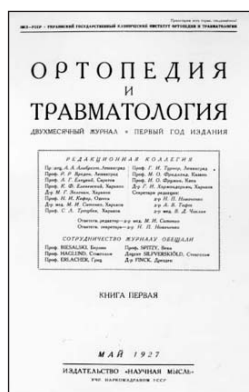
Fig. 3. The first issue of the country's first specialized journal on orthopedics and traumatology

After the liberation of Kharkiv from the fascists, KSOT was one of the first to resume its work. In 1944, 12 meetings of the society were held, all their efforts in the first post-war years were aimed at restoring