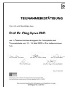
Fig. 4. CME-certificate of the congress participant