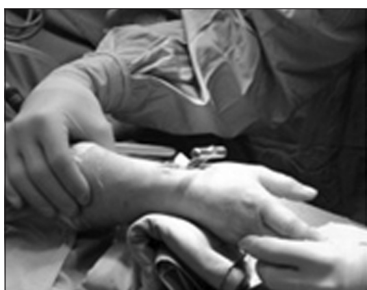
Fig. 3. Stepwise widening of the intramedullary canal