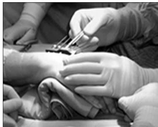
Fig. 4. Replacing the Kirschner wires with screws