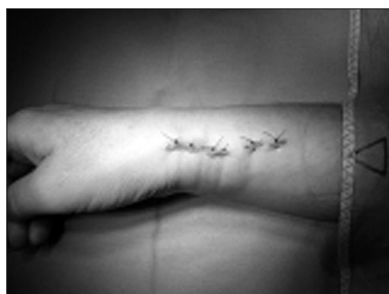
Fig. 5. Skin closure after the procedure

ideal position for the first wire is the subchondral bone area. The K-wires should not penetrate the opposite corticalis. In case of need a Repositioning of the radial length is now possible by pulling the device.