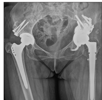
Fig. 7. Radiological image of a patient L. after arthroplasty