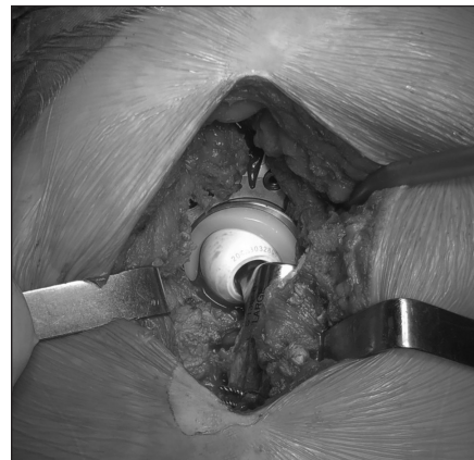
Fig. 6. Intraoperative photo