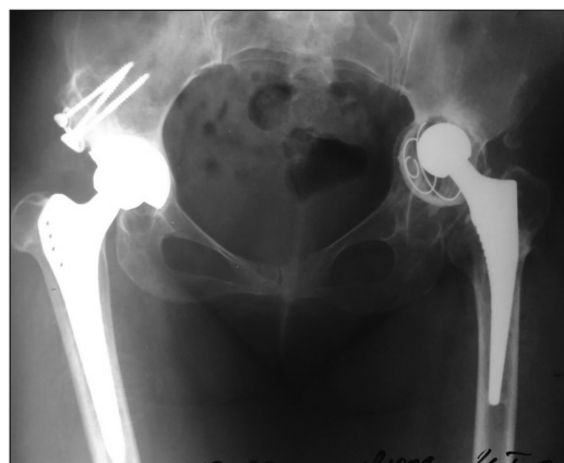
Fig. 1. Radiological image of a patient L. on admission

– puncture of the hip joint in 3 areas with subsequent cytological and microbiological studies to