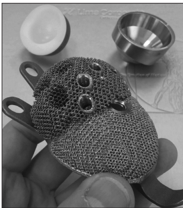
Fig. 3. Modular revision system