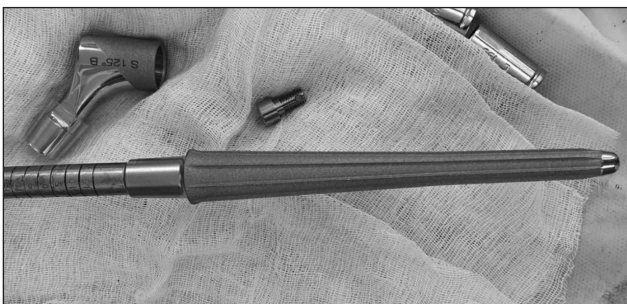
Fig. 4. Modular cementless revision leg